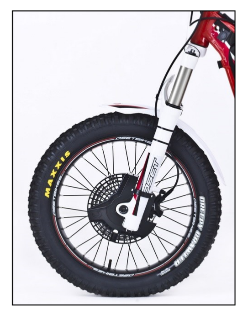
2. RST Space 2 fork fitted to an early 2017